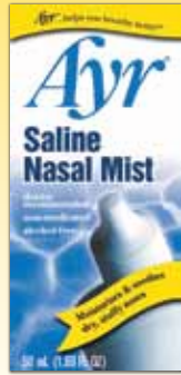
Saline Nasal Mist