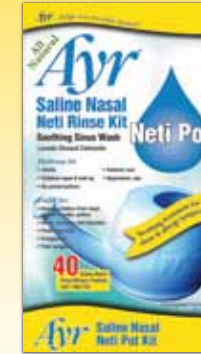
Saline Nasal Neti Rinse Kit