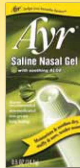
Saline Nasal Gel