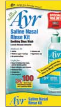
Saline Nasal Rinse Kit