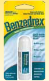
Benedrex Nasal Decongestant