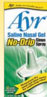
Saline Nasal Gel No-Drip Sinus Spray